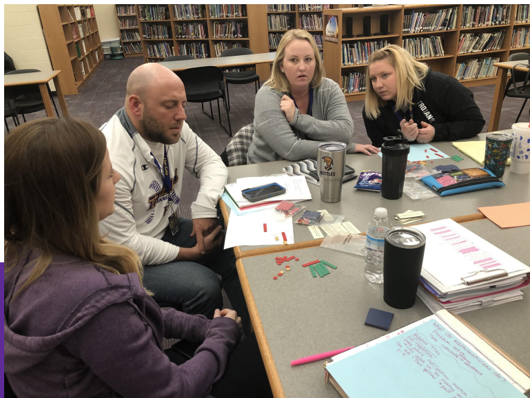
ABOVE--The JEMS Math Team discusses effective instructional practices and the use of manipulatives in the math classroom.