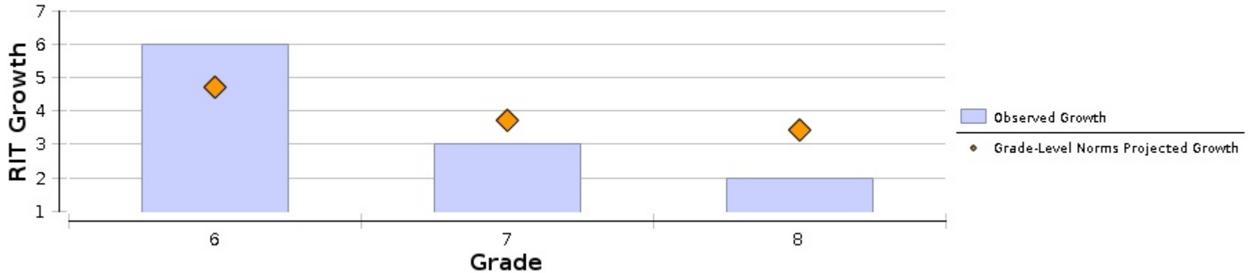
Language Arts: Language Usage